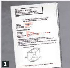
2 Calibration control 1 point