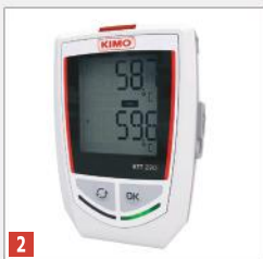
2 Data logger with 2 channels