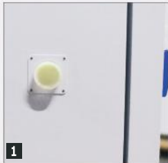
1 Ø 60mm entry port