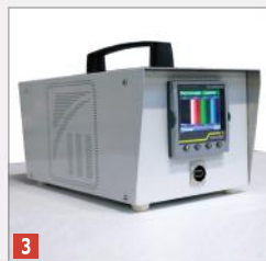
3 Portable paperless recorder with graphical screen 4 channels