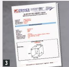
3 Homogeneity control 9 points