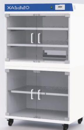
2 Subframe with castors

2 Subframe with casters (for XAS320) Elevates the cabinet for a easier loading. Swivel castors with brakes. Shelf surcharge.